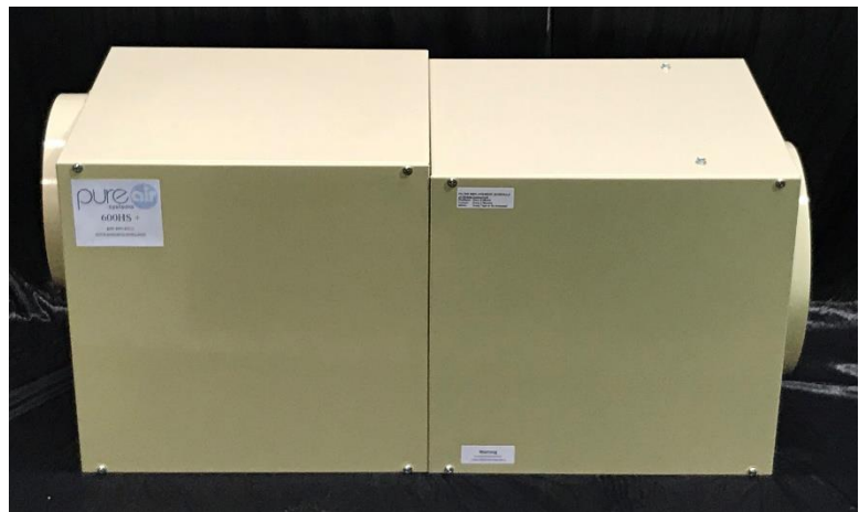
S – Housing