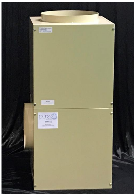
L – Housing